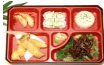
Bulgogi Chicken or Beef

Bulgogi Chicken or Beef 4 pcs California Roll 2 pcs Shrimp & Vegetable Tempura, 1 pc Egg Roll, Steamed Rice