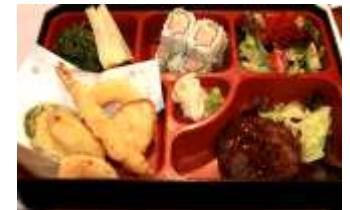
Beef Burger Steak

Beef Burger Steak 4 pcs California Roll 2 pcs Shrimp & Vegetable Tempura, 1 pc Egg Roll, Steamed Rice