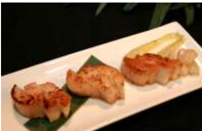
Grilled Giant Scallop