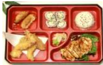
Teriyaki Chicken or Beef

Grilled Beef or Chicken 4 pcs California Roll 2 pcs Shrimp & Vegetable Tempura, 1 pc Egg Roll, Steamed Rice