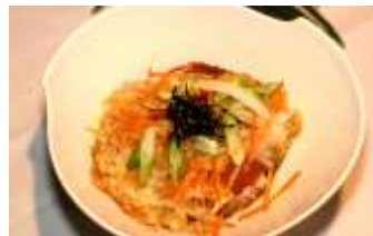
Katsudon Topped with Pork Cutlet Egg and Vegetable $ 11.95