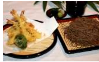
Jarū Soba with Shrimp & Vegetable Tempura

Tempura Udon or Soba $ 12.00 Udon or Soba Noodle Soup with 3 Shrimp & 4 Vegetable Tempura