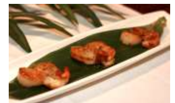
Scallop & Shrimp