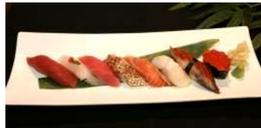
8 pcs of Chef's Choice Nigiri Sushi