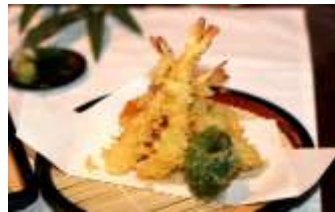
Shrimp & Vegetable Tempura