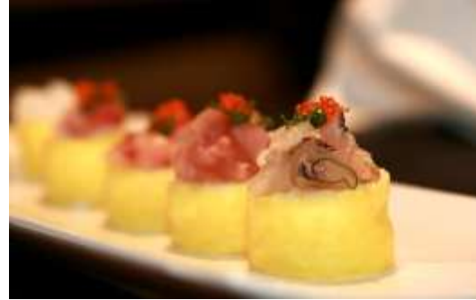
1 Special Roll of Your Choice