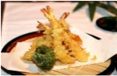
Chef Choice Special Tempura