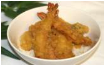
Tendon Topped with Shrimp and Vegetable Tempura $ 11.95