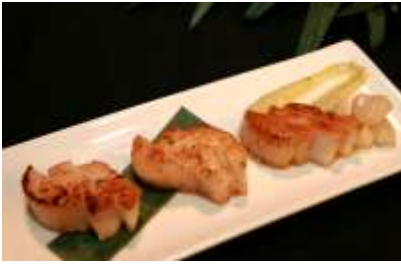
Grilled Giant Scallop

Serving Example – Menu Items could be changed by Chef