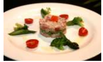
Tuna or Yellowtail Tartare

High Fatty Tuna, Salmon Toro, Yellowtail Belly Sashimi (2pcs of Each) Sushi (1pc of Each) $18.95 $13.95