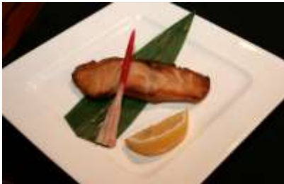
Grilled Black Cod

Serving Example – Menu Items could be changed by Chef