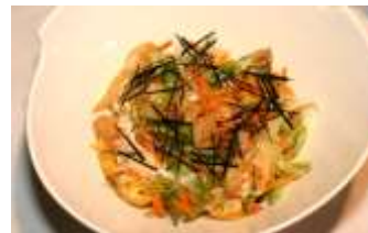
Oyakodon Topped with Chicken, Egg and Vegetable $ 10.95