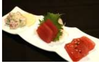
Tuna or Yellowtail 3 Ways

Fresh Salmon, capers, Mustard, Vinaigrette, Siso Leaves, Olive Oil & Flying Fish Egg $12.95