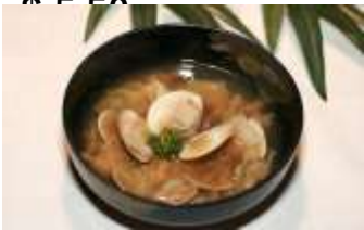
Clam Miso Soup

White Clam, Tofu, Seaweed Shiitake Mushroom with Soybean Paste Soup