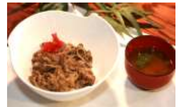
Gyudon Topped with Thinly Sliced Marinated Beef and Vegetable $ 10.95