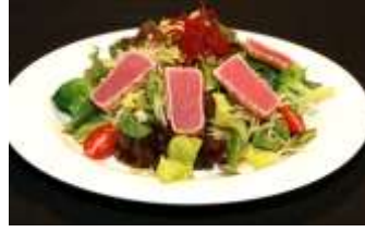
Tuna Tataki Salad

House Salad with Torched & Marinated Tuna. Served with Ginger or Miso Dressing