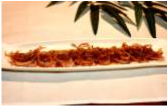
Tuna or Albacore Tuna with Crunchy Onion

Diced Tuna or Yellowtail with Japanese Mayo, Lemon Juice & Avocado $12.95