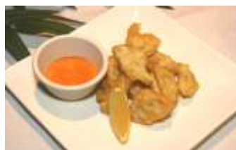
Creamy Sweet Potato

Sweet Potato Tempura with Creamy Lemon Sauce, Almond